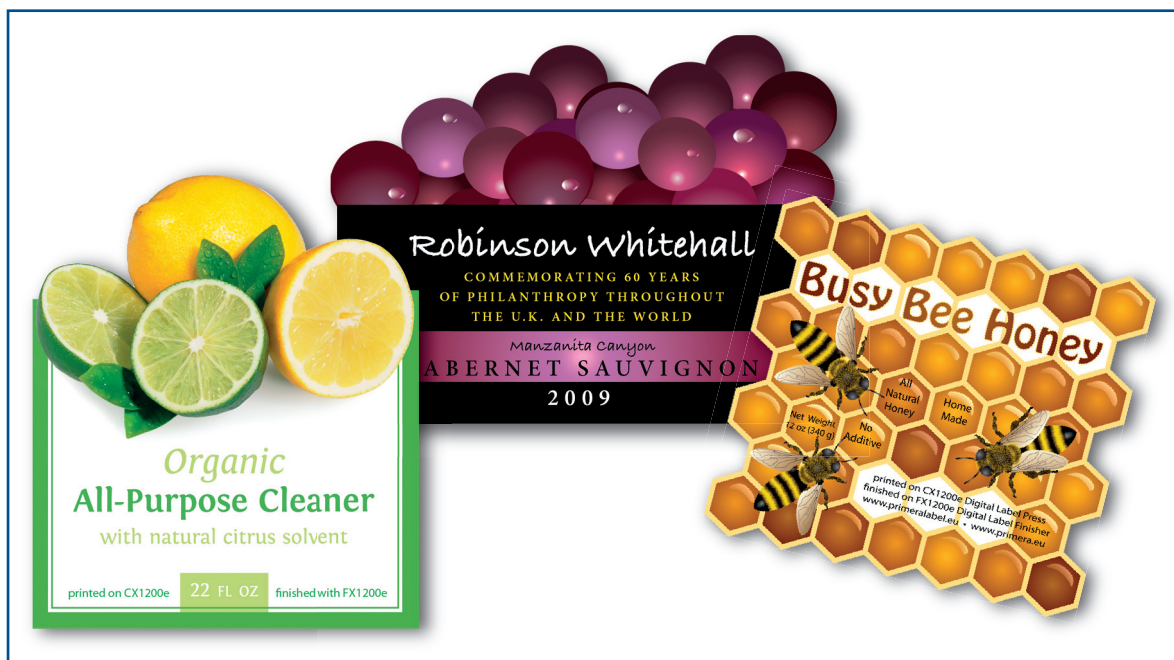
Label samples printed on CX1200e Label Press and finished on FX1200e Digital Label Finisher

Palle Jakobsen expects to run around 10,000-12,000 meters per month on the CX1200e. He expects that the investment should pay for itself in two years and is determined to invest in yet another Primera solution within short time.