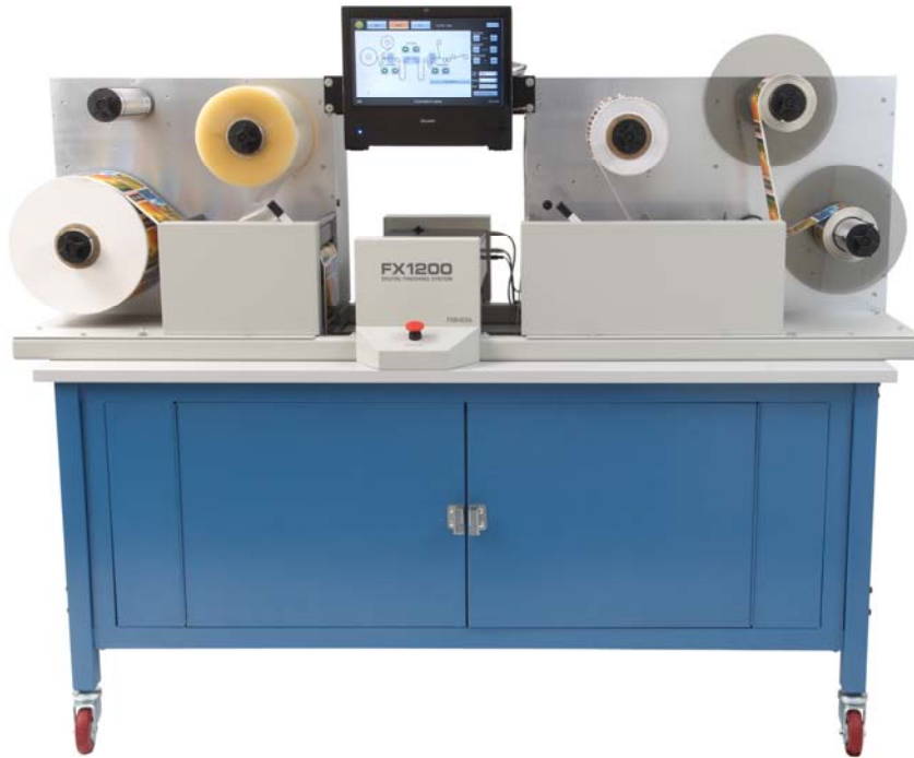
FX1200 Digital Label Finishing System (Shown with optional lined lamination mandrel)

Until now, the main disadvantage of digital die cutting systems has been their slow production speeds. Primera has changed that with its new FX1200 Digital Label Finishing System. FX1200 has a patent-pending multiple knife blade system that can quadruple finishing speeds.