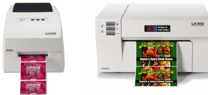
LX400 (left) and LX810 (Right)

For quantities of just a few to hundreds of labels at a time, Primera's LX400 and LX810 are excellent choices. LX400 is affordable enough for virtually any business and prints labels up to 4" wide. LX810 has the same print speeds, but includes a separate monochrome black ink cartridge and prints up to 8" wide.