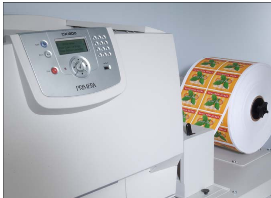
Produce up to 12" (305mm) diameter rolls of digital labels on CX1200

Two digital technologies stand out and are clearly superior for producing the highest-quality, lowest cost output in short- to medium-sized runs: inkjet and laser-based color label printing. Primera has both technologies available now with its LX-Series Color Label Printers and CX1200 Digital Label Press with FX1200 Digital Label Finishing System.