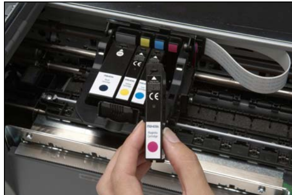
Separate ink tanks on LX900 Color Label Printer

LX900 is the best choice for printing from just a few to many thousands of labels at a time. It has the lowest cost per label of any of Primera's inkjet-based label printers.