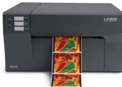
LX900 Color Label Printer

Primera's newest LX-Series Label Printer, LX900, has extremely fast print speeds – up to 17 times faster than LX400 and LX810. LX900 also has separate ink cartridges for each color; saving money on every label you print but especially if you print more of one color than another. With separate ink cartridges, you replace only the cyan, magenta, yellow or black ink that needs replenishing.