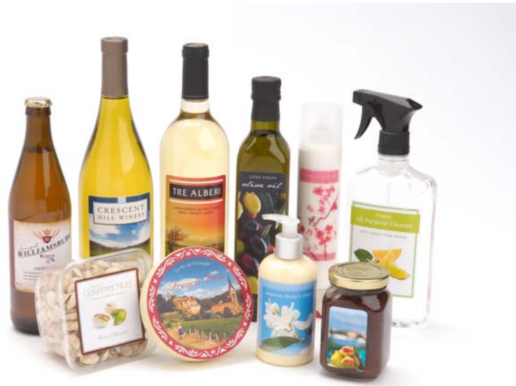
Some of the products that can benefit from digital label production

Putting the most professional color labels possible on your products will set them apart from others. This is especially important for smaller manufacturers who can actually increase their sales by making their products stand out through innovative packaging and labeling. It also allows manufacturers of all sizes to offer private label goods in smaller quantities.